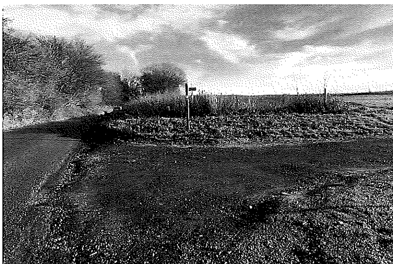
Suggested location no. 3 - use existing direction post

Recommendation – To agree to install the dog fouling bins at the above locations and to approve the annual emptying cost of £43.49 per bin to be allocated from the Litter/Dog Bin Budget.