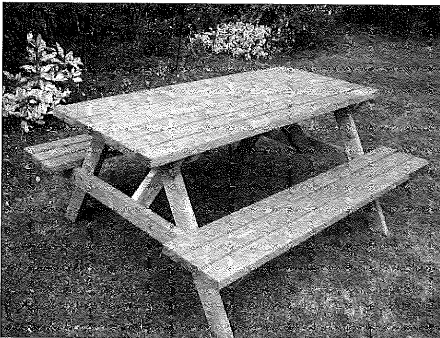
Example of wooden 4 seater picnic bench. Priced at £125 plus VAT. Dimensions: (l) 120cm x (w) 140cm x (h) 73cm

Prices were also obtained for one wooden picnic bench and one wooden picnic bench with wheelchair access, see below.