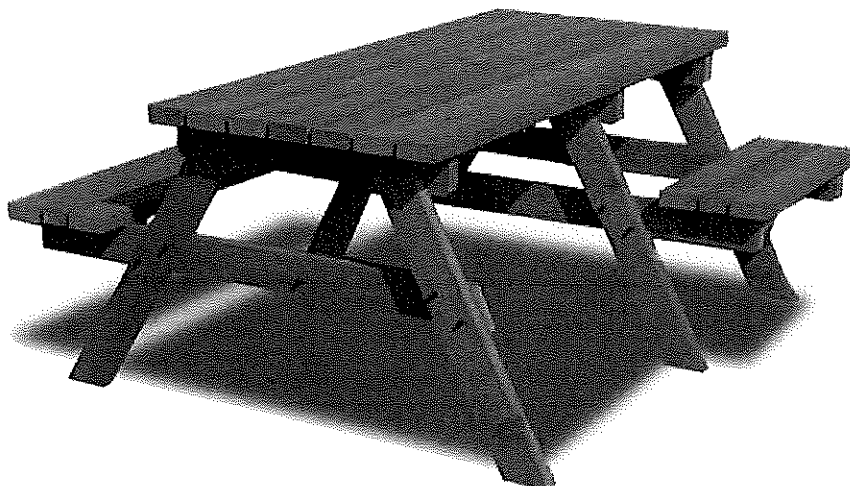
Example of wooden picnic bench with 900mm wheelchair access bay. Priced at £255 plus VAT.